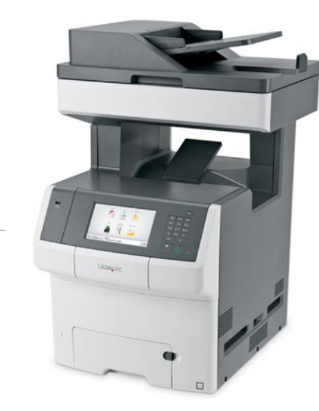
Robust high-quality color

Rely on Lexmark X740 Series color laser MFPs for the high-quality color printing, scanning and copying essential to business. Speed and reliability mean minimal waiting and few interruptions. You consistently and quickly receive vibrant documents.